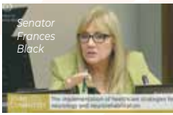
Senator Frances Black

said it was a 'no brainer' that having specialist nurses makes a huge impact on the lives of people with neurological conditions. Senator Frances Black highlighted the need for neuropsychologists.