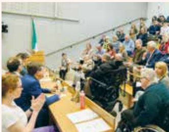
AV room attendees on April 24th

NAI representatives reminded Oireachtas members that neurological conditions now represent the leading cause of disability worldwide and affect over 860,000 people across Ireland.